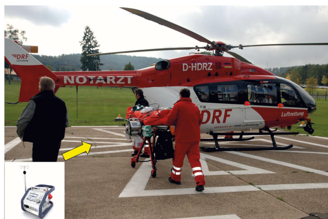
Fig. 1. Helicopter transport with the Cardiohelp system.

Patient no. 3: A 24-year-old patient had a car accident being not buckled up with his seat belt. The patient was catapulted out of his car and experienced traumatic head